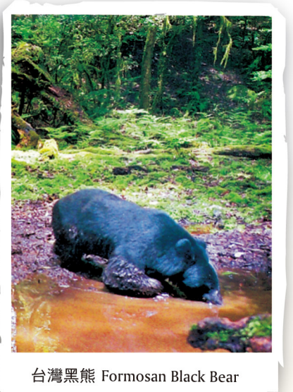
台灣黑熊 Formosan Black Bear

The Walami area, known for its rich natural resources, has been dubbed as “the heaven for wild life”. The majority of the trail was made along the Batongguan Road built by the Japanese, spanning across 14km. The trail rises gently along the Lakulaku River with a total elevation of 1000m.