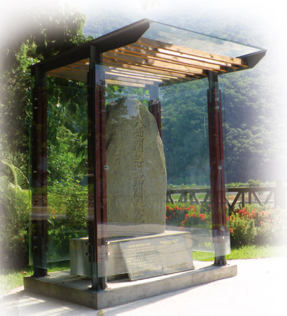
「八通關越道路開鑿紀念」石碑 Batongguan Road Completion Monument 正面碑文為：「八通關越道路開鑿紀念」 背面碑文記載施工起始及完成日、施工人數等工程概要。

The entire park had once been the region where the Bunun aboriginal tribe lived, thus many traces of the old community can still be seen today, including heart-touching events of the rebellion against the Japanese government.